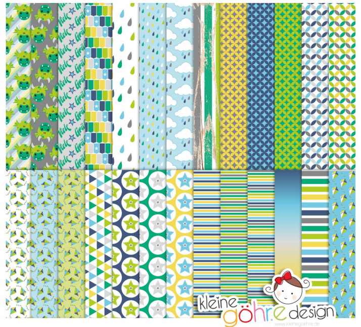
digitale Papiere "Drachen Muster 2"