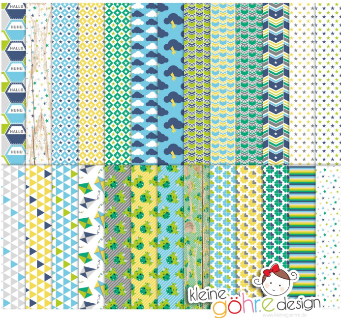
digitale Papiere "Drachen Muster 1"